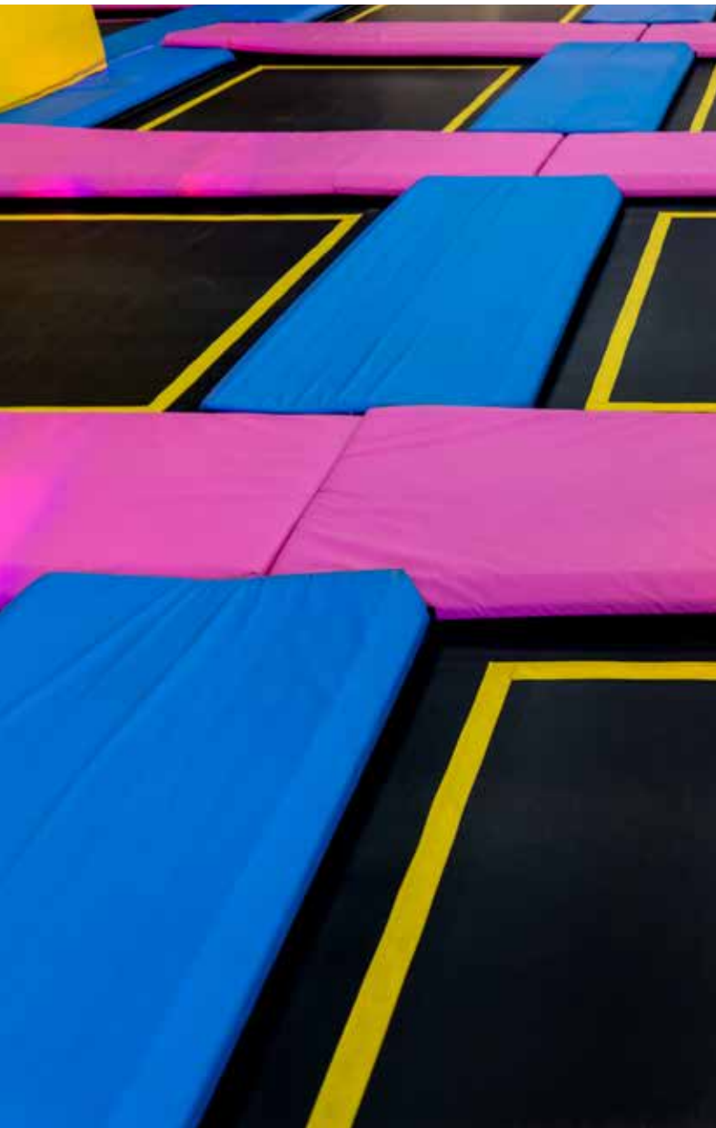
JUMPING CASTLES & SPORTING EQUIPMENT